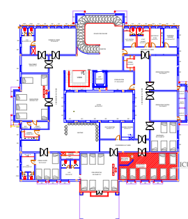
TRAUMA CENTRE FIRST FLOOR PLAN

LEGEND: PROPOSED FACILITY UPGRADATION & EXTENSION OF EXISTING FACILITY