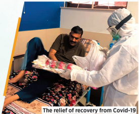
The relief of recovery from Covid-19

The ICUs and the HDUs at all facilities were developed to ensure infection control measures and epidemic management as part of the Revamping Initiative