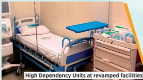
High Dependency Units at revamped facilities

of Ventilators and development of 8 BSL III Labs amid COVID-19. The division of labor with roles specified according to different specialties had already been mapped, thus it became possible for Punjab to launch an organized response to the Pandemic.